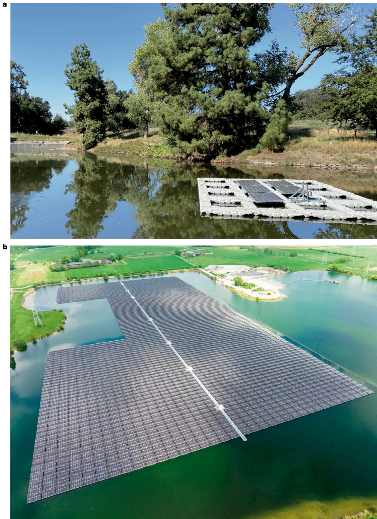
Fig. 3 | Examples of floating photovoltaics. a, A floating photovoltaic system around the University of California at Davis designed to reduce green algae by improving aeration with solar energy. b, A floating solar farm producing clean renewable electricity energy and reducing reservoir evaporation in Flevoland, the Netherlands.