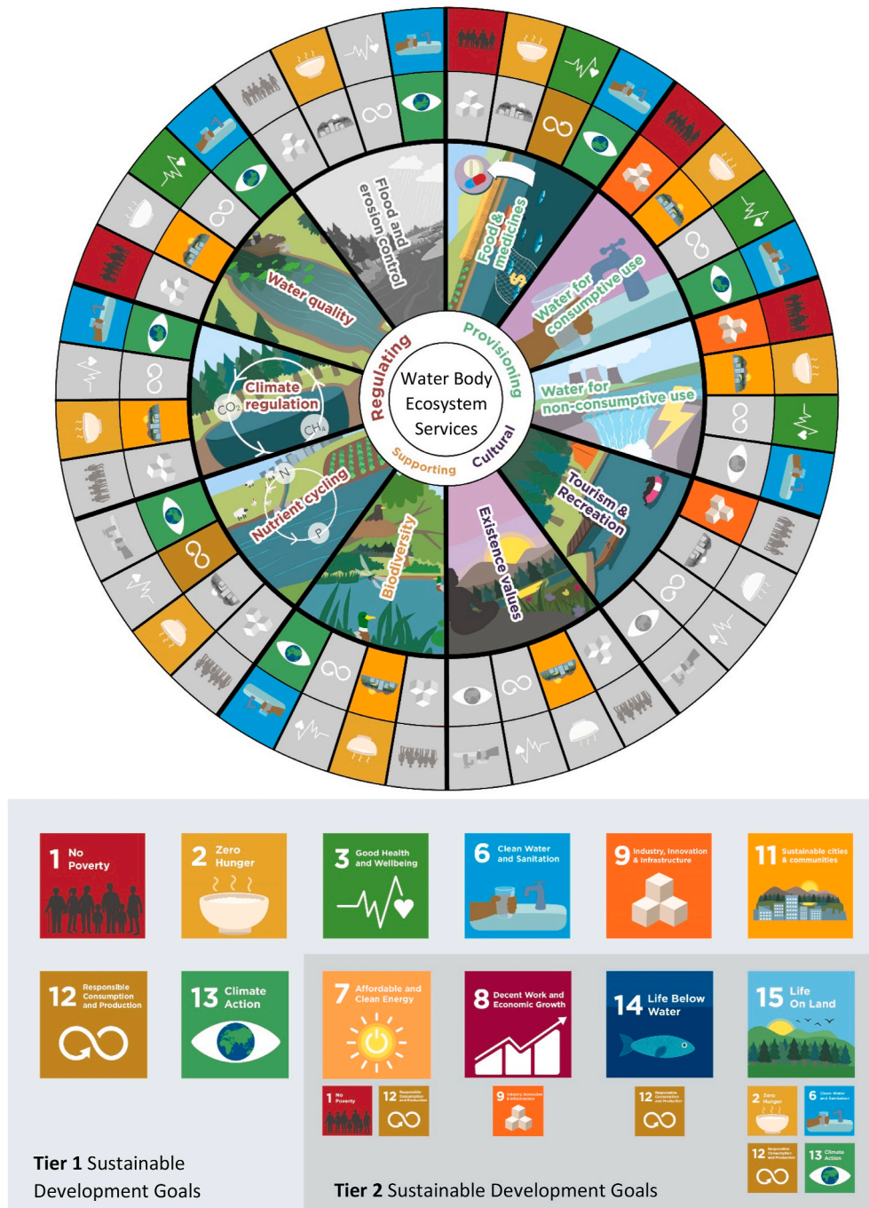
Fig. 3. Generalised framework linking outcomes gathered from the knowledge system (e.g. international survey, evidence review and stakeholder workshop) with the ecosystem services delivered by freshwaters (based on Wood et al. [41]) and the United Nation's Sustainable Development Goals (SDG). Links between Tier 1 (light grey box) and Tier 2 (dark grey box) SDGs are based on Le Blanc [43].

Finally, means to produce urgently required low carbon electricity should be compared to the counterfactual in order to maximise the overarching sustainability of the energy system. If not FPV here, then where? If not FPV, then what? To make such decisions improved knowledge and better integration of ecosystem services with